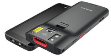
The CT37: 5G mobile computer on the Mobility Edge™ platform, elegant, slim, powerful, durable, and easy to use.

The CT37 also comes with the latest 5G and Wi-Fi 6E technology to stay connected in both indoor and outdoor environments. 5G offers the highest bandwidth and lowest latency available for frontline workers. Whether you are on a private 5G or CBRS network, or a Wi-Fi 6E environment, your networks can continue their workflows with reliable uptime.